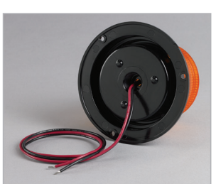
Built-in permanent 1/2" pipe mount