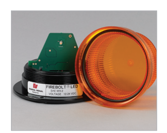
Shatterproof dome and base with o-ring protection against moisture