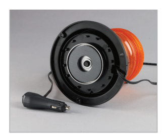
Magnetic mount cigarette plug option is available

Designed to meet the demands of a variety of work zones including snow plows, forklifts, utility trucks and construction vehicles; the Firebolt LED is made of a shatterproof, polycarbonate dome and base and includes an o-ring to help protect against moisture. The Firebolt LED has a built-in permanent ½" pipe mount base. Magnet mount models with cigarette plug are also available.