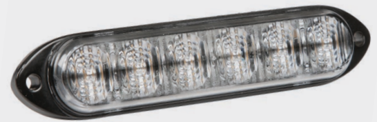
98341 / 98342 / 98343 / 98344 / 98345