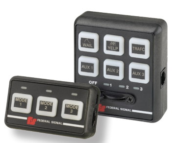
3- and 6-button controller