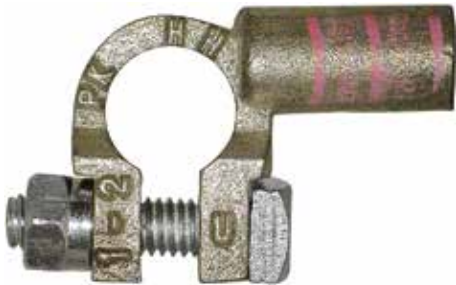
● COLOR CODE: Pink