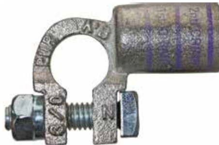
● COLOR CODE: Purple