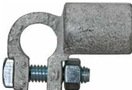
● COLOR CODE: Yellow