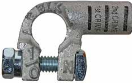
● COLOR CODE: Black