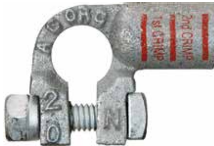
● COLOR CODE: Orange