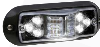
White steady-burn flood/alley