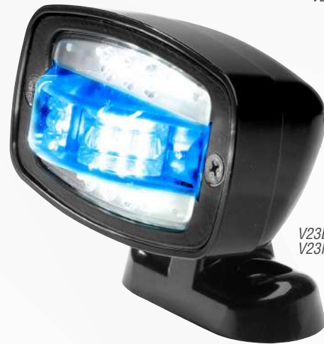
V23BTPB with V23PEDC