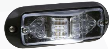
White ground illumination