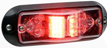
SAE 845 Class 1, 180° warning

Featuring Whelen's innovative optic technology, V-Series Super-LED® lightheads are versatile and efficient. Utilizing multiple planes of light in one lighthead, models are available in a variety of sizes for use in numerous applications. Hard-coated lenses minimize environmental damage from sand, sun, salt, and road chemicals.