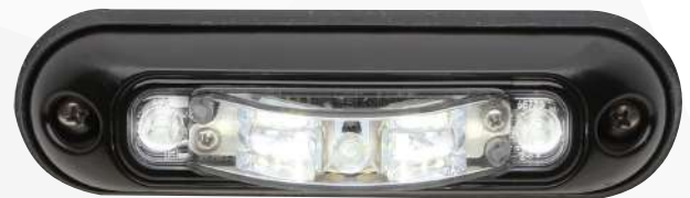
Surface mount IONSV3C