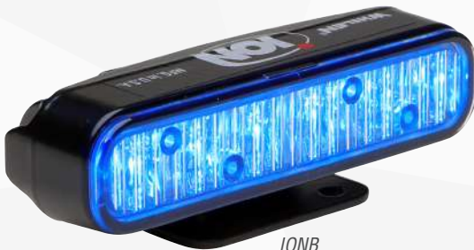
IONB Universal mount