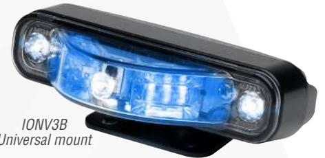
IONV3B Universal mount