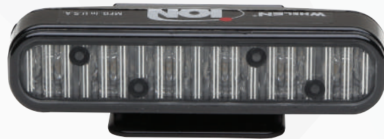
ION Smoked lens