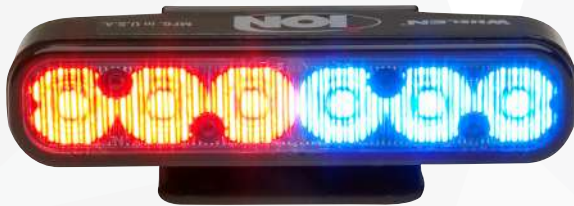
WIONJ Universal mount