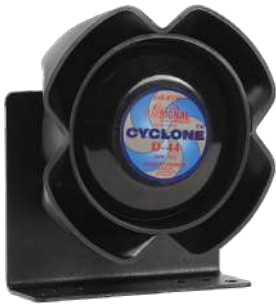
D-44 with SPBRK-16