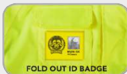
FOLD OUT ID BADGE