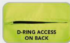
D-RING ACCESS ON BACK